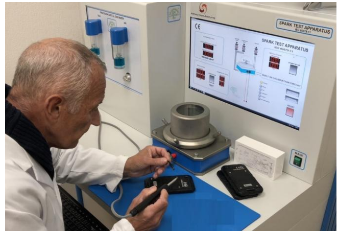
All devices are tested in the explosive atmosphere of the spark-test apparatus for intrinsically safe circuits

ATEX: Unit Assessment Certificate Zone 2, II 3G; ec ic IIC T4 Gc Zone 22 , II 3D; tc IIIB T135°C Dc